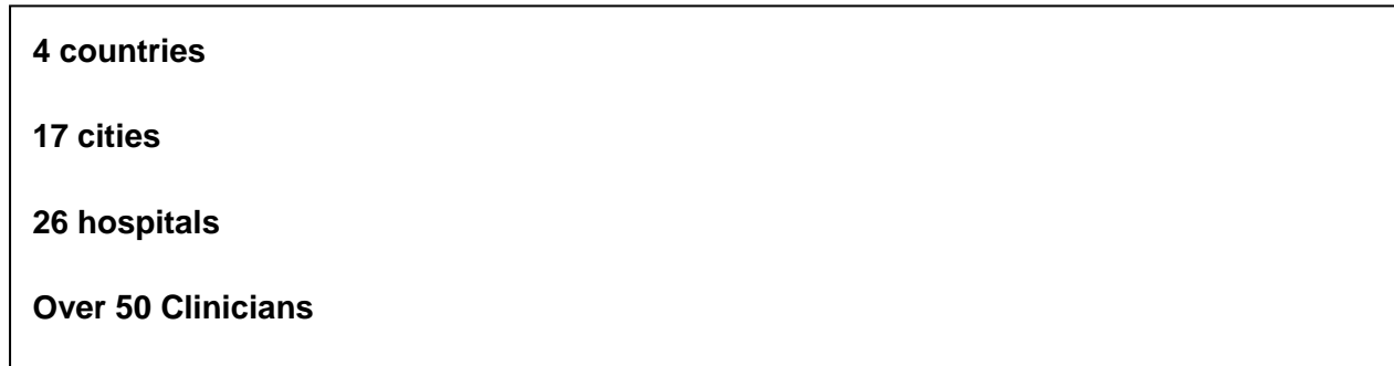
Figure 7: Potential users & opinion leaders consulted through out the project

For VAPCare, figure 7 and 8 below depict the extensive exercise done through-out the project. Results indicate that over 90% potential users gave a thumbs-up to the product concept and design.