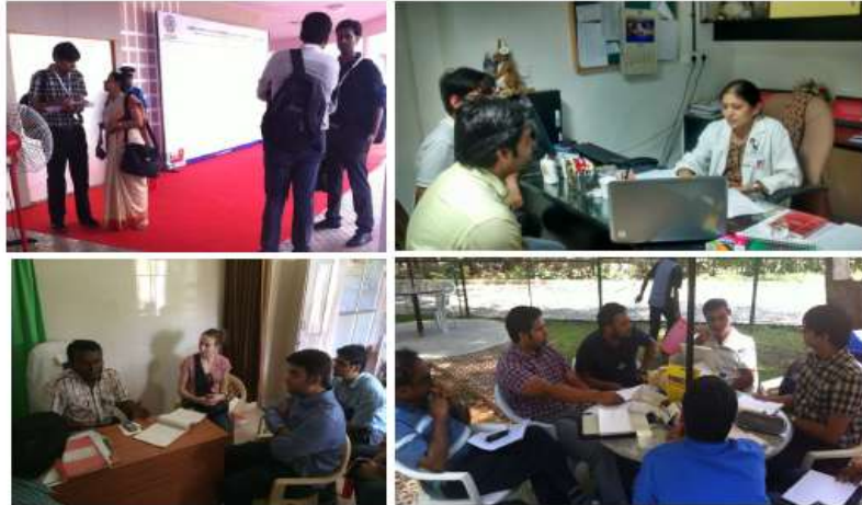
Fig 29 : Validation with Key opinion leaders (KOL)

The need was also validated with other emergency physicians and intensivists in Bangalore, Hyderabad and Mumbai.