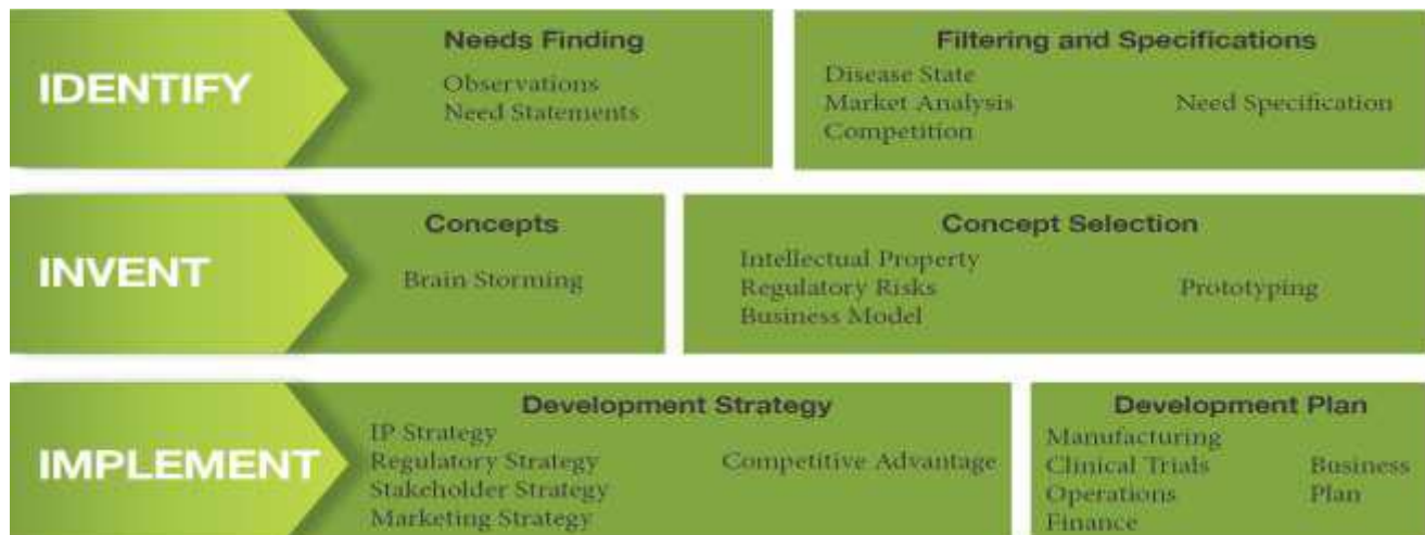
Figure 1: Bio-design process framework

Here is what we have come up to doing it in medical device space; following a bio-design process. It can be applied to any field. The framework is as under –