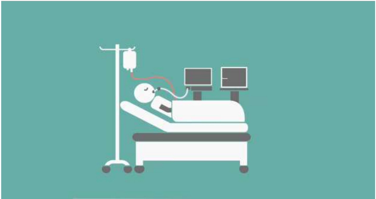
Figure 6: Outline of solution concept

And we start thinking about the Solution Concept.